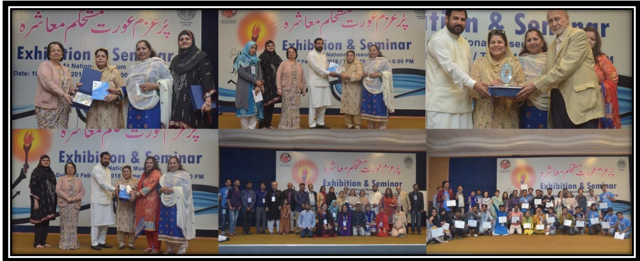
Exhibition & Seminar of Empowered Women Empowered Society at National Museum Karachi