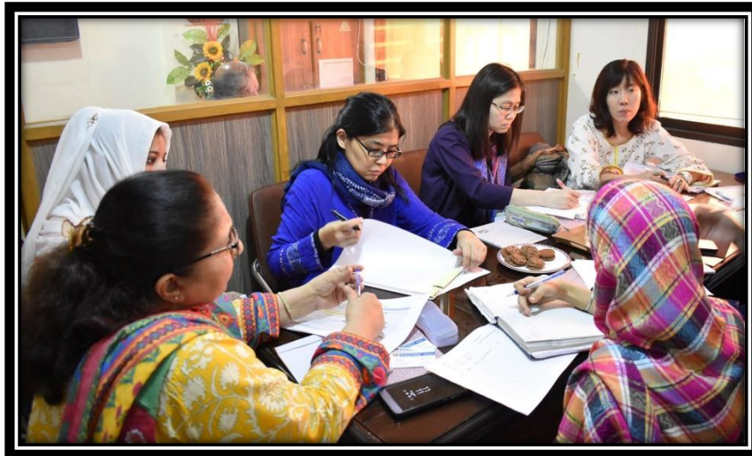
Meeting with JICA Team at WDFP Head Office