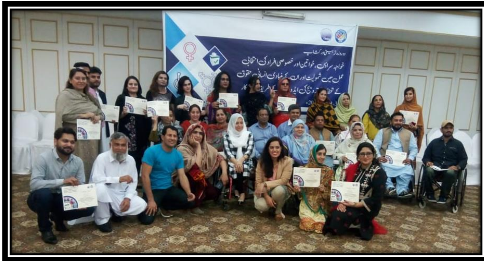
Certificate distribution ceremony at Margala Hotel Islamabad

TDEA-CIP selected 15 organizations throughout Pakistan from provinces which were divided into three marginalized clusters: Women, Trans-genders and Special Persons (PWD). To facilitate women, WDFP is selected from Sindh and decided to perform different activities in Karachi between November 27, 2017 and March 14, 2019.