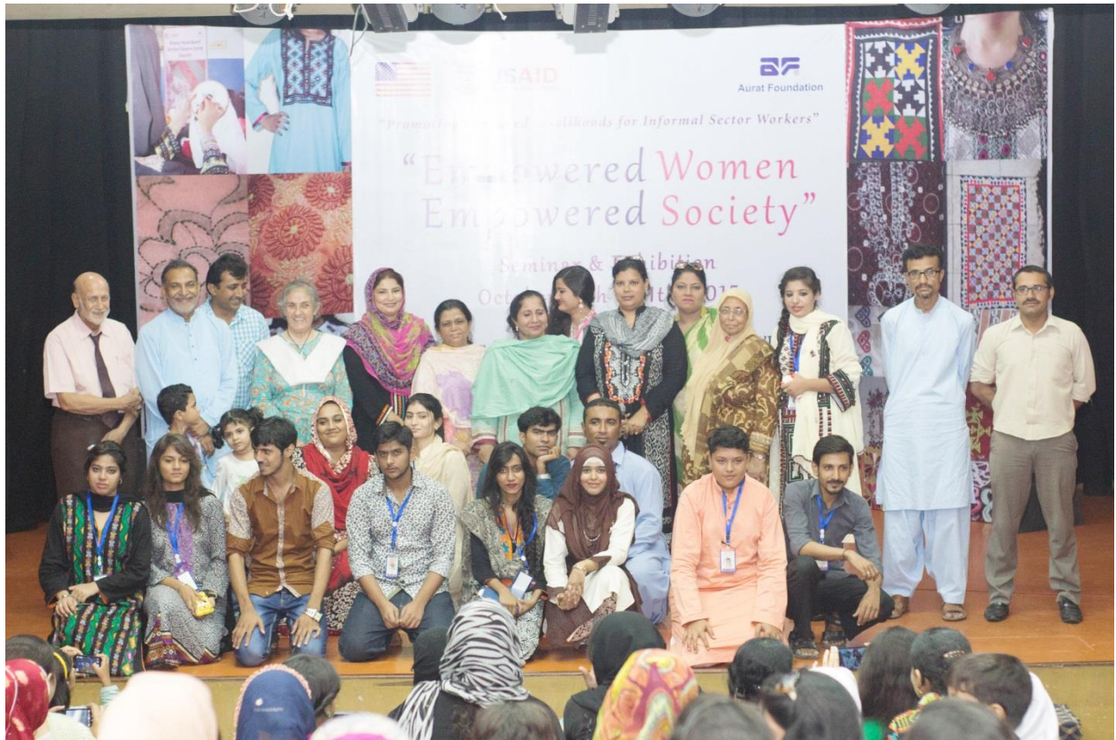
Group Photos of Officials; Aurat Foundation (AF), Women Development Foundation Pakistan (WDFP), Health and Nutrition Development Society (HANDS) and Benazir Bhutto Shaheed Youth Development Program (BBSYDP).