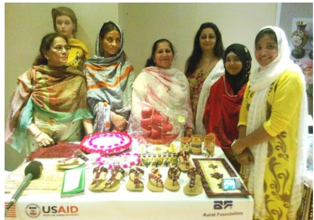
Linkage developed with Women Chamber of Commerce