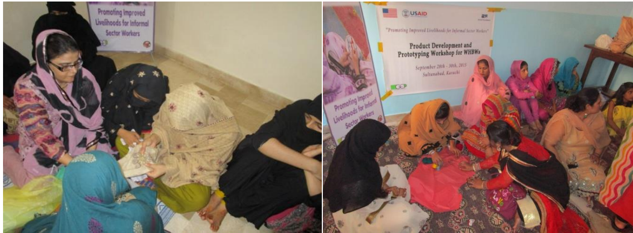
Pictures showing the activities carried out with the WHBWs of Lyari and Sultnabad during Practical Trainings of Skill Development.

Keeping in view the contentment and ease of WHBWs the Practical Trainings were started in field i.e. at homes of Women Home Based Workers. In these trainings, master trainers visited the groups of home based workers and observed the quality of their work. She gave them in hand knowledge regarding stitches and color combinations to be used in designs so that they produce better products for the exhibition.