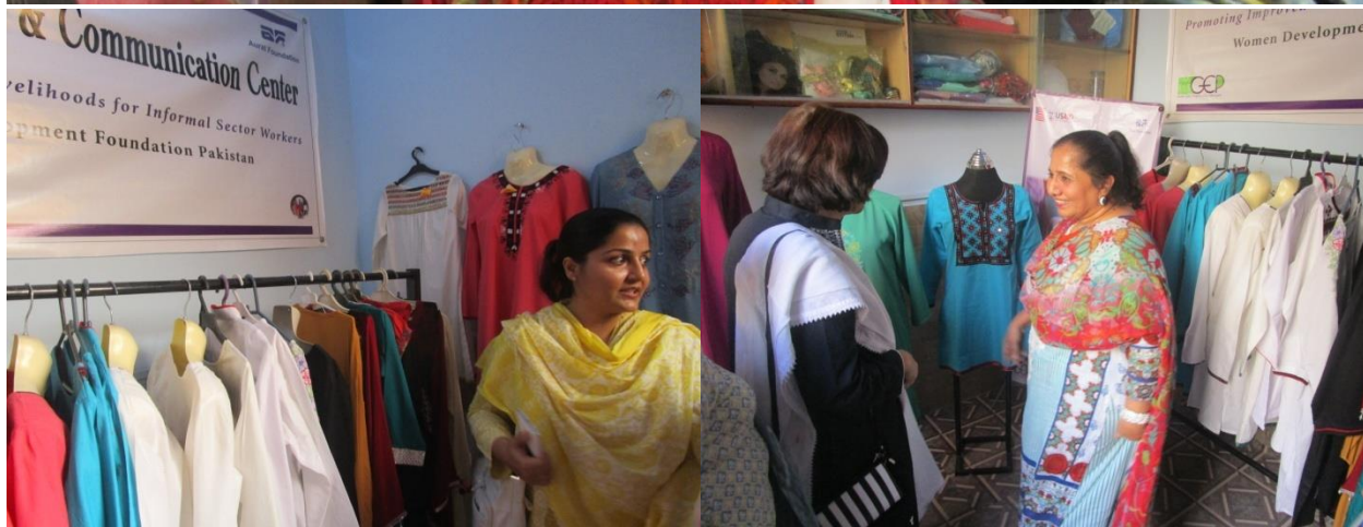
Glimpses of Inauguration of TFCC by WDFP