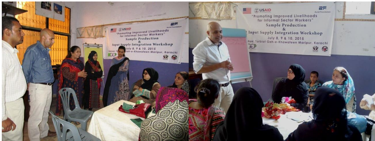
Showing session during 3rd TOT with Master Trainers

This training was a totally new experience for the home based worker master trainers which enlightened their minds to look in the new direction for the development of their skills and a better result in the form of raised income.