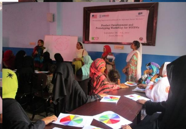
Pictures showing the activities carried out with the WHBWs of Lyari and Sultnabad during Theory Trainings of Skill Development.