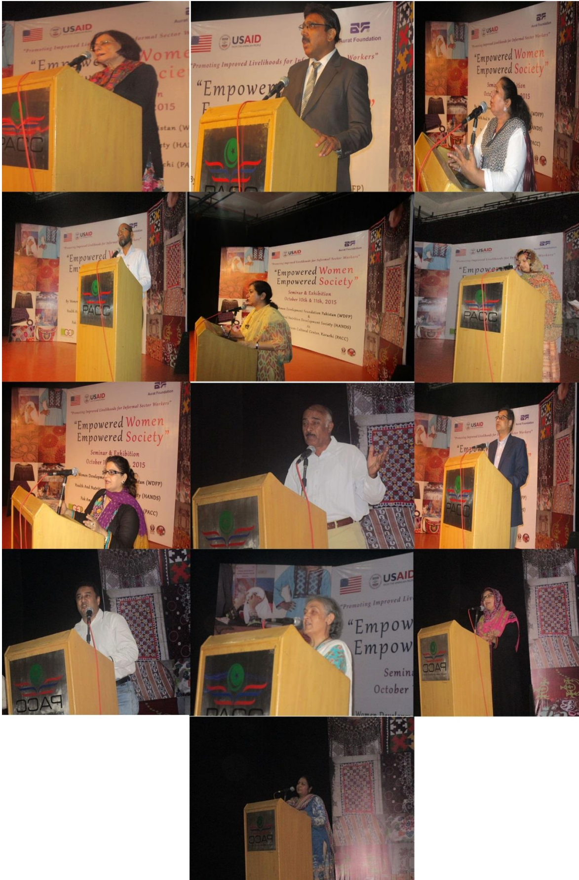
Pictures of Guest Speakers of the Advocacy Seminar and Exhibition “Empowered Women Empowered Society” on 10 th & 11 th October 2015 at PACC.