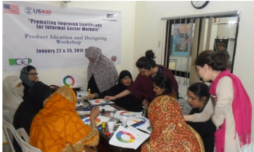
WHBW Master Trainers engaged in First Training of Trainers at WDFP and HANDS offices

In January 2015, first round of training of master trainers was organized by with the support of Training Consultants from MOGH. It was a 2 days exercise; On day 1 of training, M.T.s were trained regarding Color Theory/Color Matching, Elements and Principles of Design, on day 2, they were trained on Product Ideation and Innovation, Design Process and Potential Product Portfolios. The activities of making color wheel on day one and mood board on day two were highly appreciated by home based workers as it was a great addition in their knowledge and helped them to increase creativity.